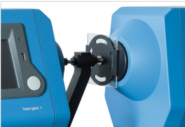
The measurement of haze is used to determine abrasion resistance of transparent materials. The haze-gard i Abrasion Holder facilitates positioning of the abraded area in the measurement beam.