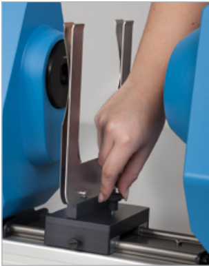
Sample holder for films and sheets. The precision guide carriage allows easy replacement of different holders.