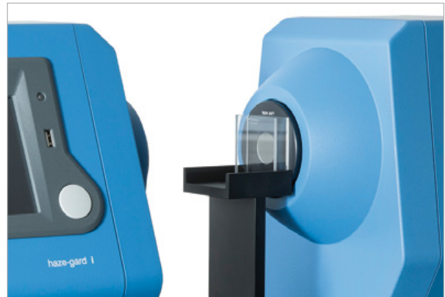
Liquids are best measured using cuvettes and the cuvette table.